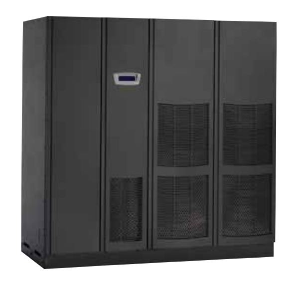
Eaton 9395 UPS