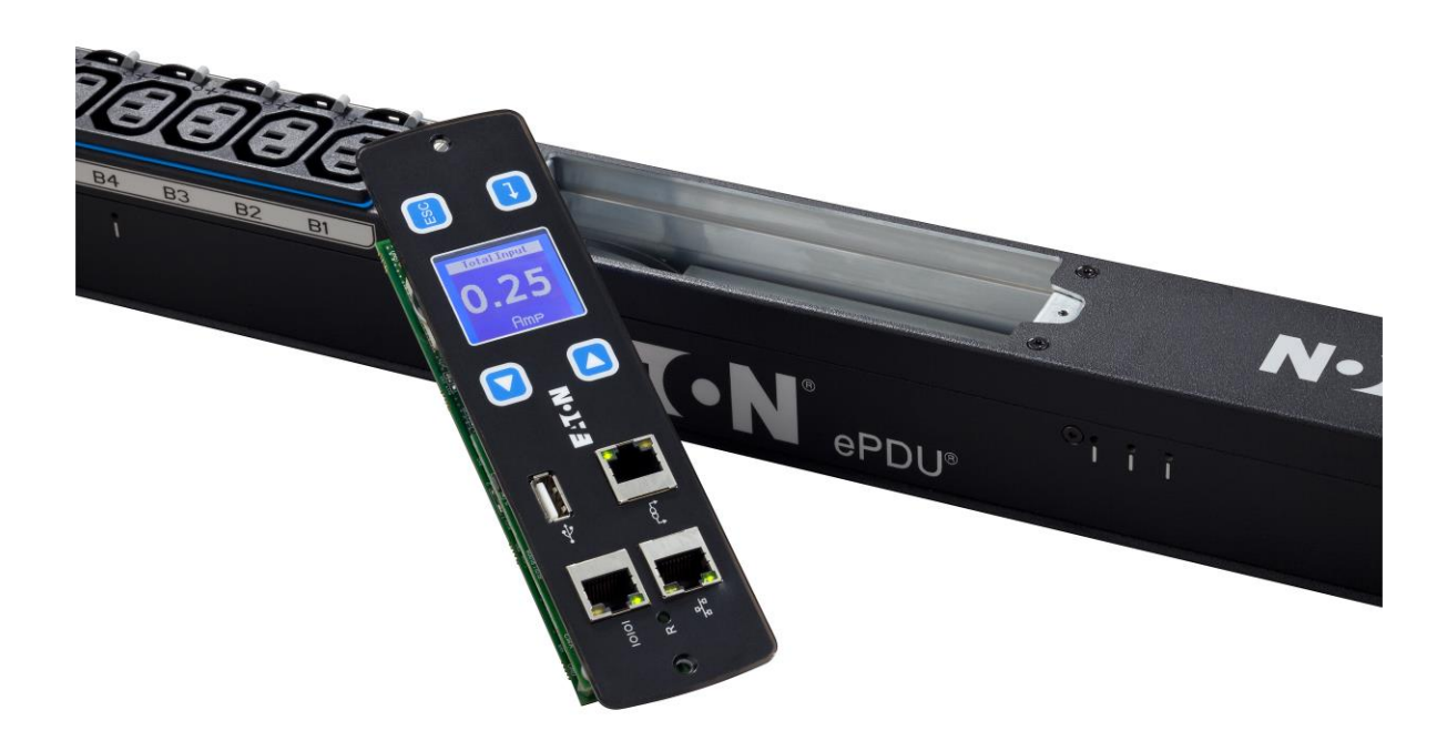
Figure 4. A hot-swap network meter card minimizes downtime on a rack PDU.

Meter accuracy on next-generation rack PDUs has improved to within ±1% of actual value, which is known as billing grade accuracy. This is a significant improvement over legacy models, which primarily used meters for load balancing. With such a high level of accuracy, data centers are able to effectively measure power usage to all outlets, enabling department billing as well as the ability to track usage for local utility rebate programs. Billing grade accuracy may be especially important to co-located data centers, which can use these measurements for tenant power billing. In addition, the meter on next-generation rack PDUs can still be used for load balancing and helps data center operators identify open capacity.