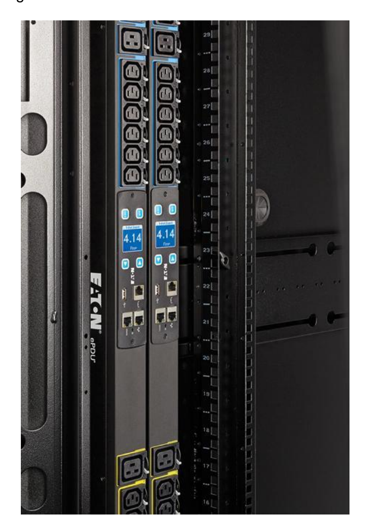
Figure 1. Rack PDUs with racks from the same vendor ensure compatibility, which enables agility in the data center.

The best way to facilitate agility: make sure a vendor can provide both the rack and the PDU. Compatibility goes a long way to ensure ease of use and optimize the way the two components work together.