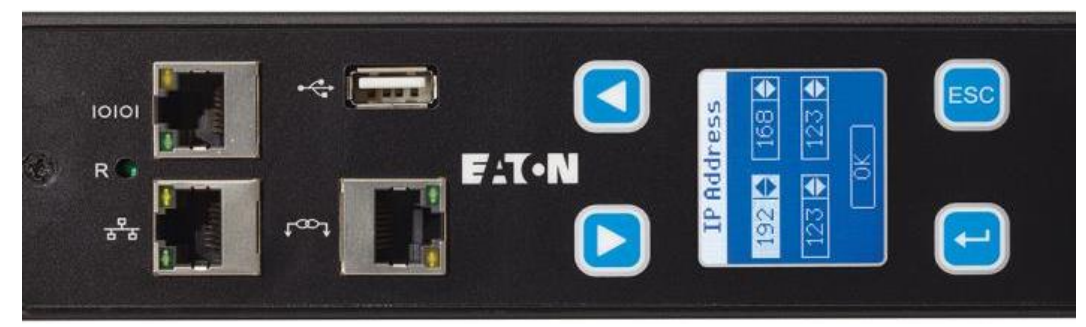
Figure 2. An advanced pixel LCD screen with pull-down interactive menu options on a rack PDU.

Of course, even the most agile environment is compromised if the prospect of downtime remains a persistent concern. Here, too, next-generation advanced-rack PDUs can have a significant impact. One drag on reliability is issues of IEC plug retention. It is not uncommon for plugs to get bumped loose in the rack, leading to server shutdown. A rack PDU with IEC plug retention prevents the accidental dislodgment of a plug and can greatly enhance reliability. There are several methods to secure the plug, but a solution integrated into the outlet is ideal to avoid the bulk of external clips or cable trays. It is also important to avoid solutions that require proprietary power cord solutions that involve additional expenses to the tune of 20-50%. On the other hand, an integrated IEC outlet grip reduces the total cost of ownership and improves reliability.