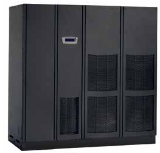
Eaton 9395 550 kVA UPS

They have extensive experience with data centres and are experienced with low and medium voltages. The good maintenance contracts and attractive prices which we agreed for the whole project testify to this. The positive experiences we have had at this centre form an excellent prelude to establishing another twin data centre here in Hengelo."