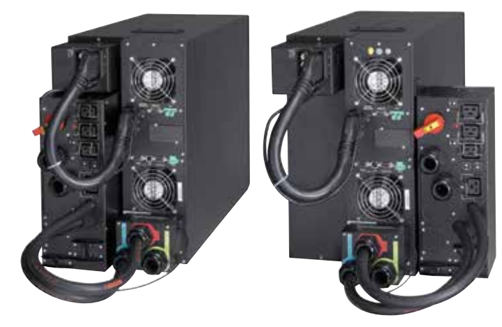
Eaton 9PX UPS with Maintenance Bypass

For easier integration, Eaton HotSwap Maintenance Bypass (MBP) can be mounted on the UPS in multiple ways, as well as being rack and wall mountable as standard.