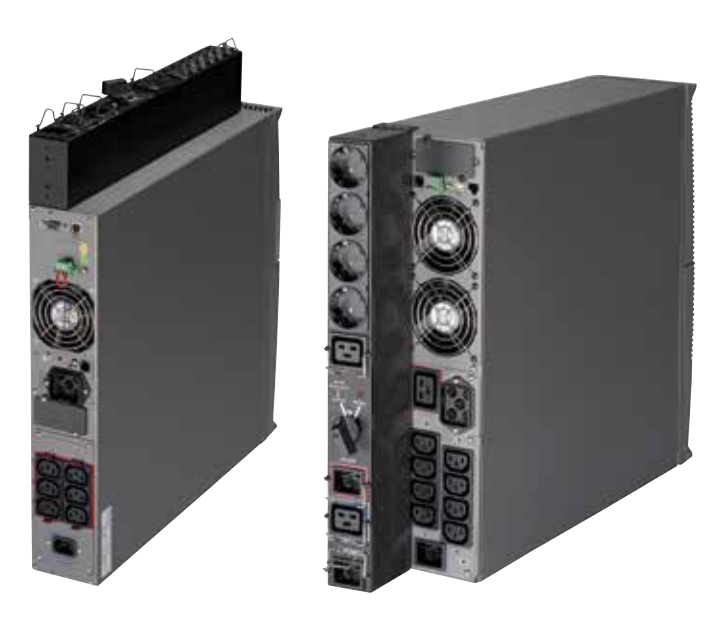
Eaton EX with Maintenance Bypass